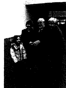
Ribbon Cutting, 2002

The mission of The Eric Carle Museum of Picture Book Art is to inspire, especially in children and their families, an appreciation for and an understanding of the art of the picture book. In fulfilling our mission, we aspire to build bridges to an appreciation of art of every kind and to provide an enriching, dynamic, and supportive context for the development of literacy. We deliver this mission by collecting, presenting and celebrating the art of the picture book from around the world and by providing interactive experiences and programs that are engaging and educational.